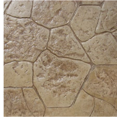
Khaki with Adobe release