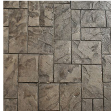
Khaki with Walnut release