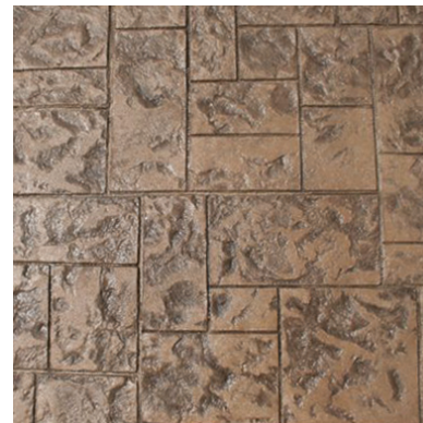
Caramel with Adobe release