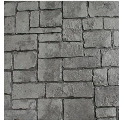
Steel Gray with Dark Gray release