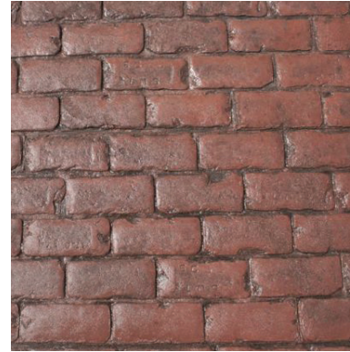
Brick Red with Dark Gray release